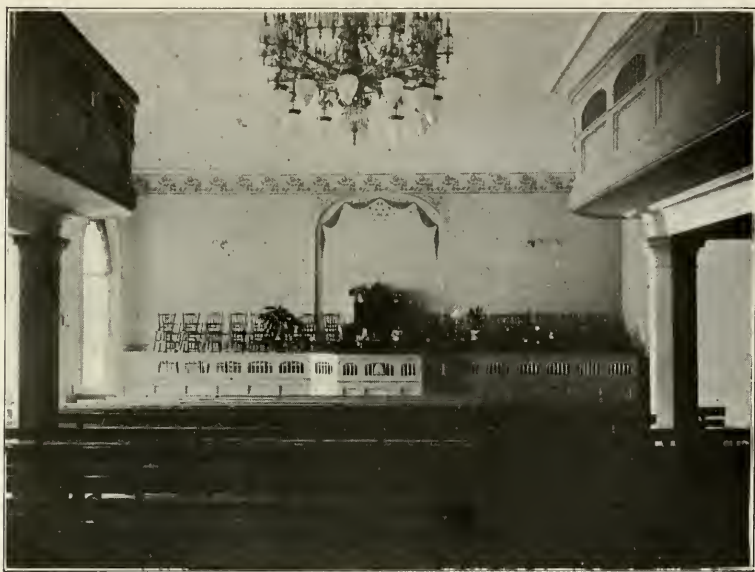
INTERIOR OF THE STOCKHOLM MISSION HOUSE, LOOKING FROM THE GALLERY

When these two countries had obtained their splendid houses, we turned our attention to Sweden. I went to Stockholm but found great difficulties confronting me there, since the Swedish law does not permit strangers to buy building lots. We were obliged, therefore, to secure agents to act for us. We bought, at last, a building lot in a very public place, in an excellent district. There we built a large four-story building, so arranged as to make it a worthy and most beautiful place for presenting the